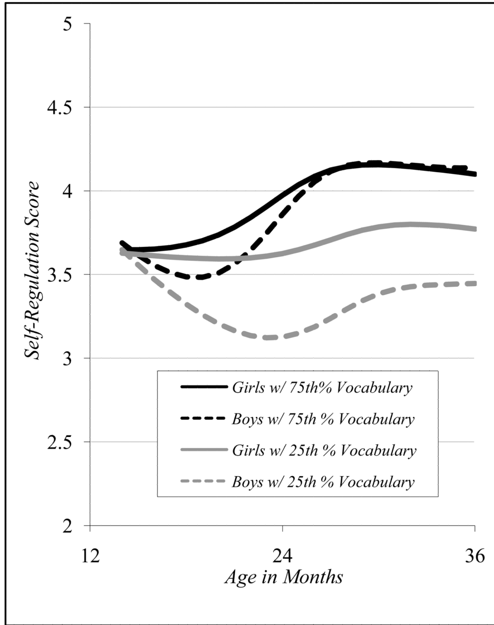
Figure 2. Effect of time-varying vocabulary on boys’ and girls’ self-regulation during toddlerhood, controlling for maternal vocabulary. Note on Figure 1: The shape of the curves reflect the influence of vocabulary as it grown cubically; to determine the appropriate trajectory for vocabulary we analyzed its basic growth in the current sample.